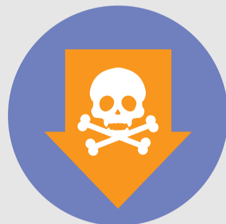
Minimize environmental threats