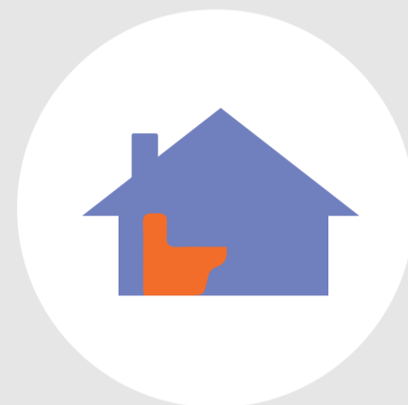
Non-public (Private or Shared)

The system is considered "improved," if it hygienically separates human excreta from human contact and is not public, meaning that it can either be private or shared.