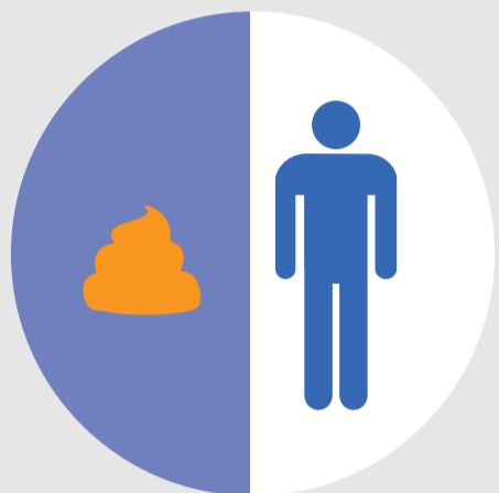
Separate Human Excreta from Human Contact

The system is considered "improved," if it hygienically separates human excreta from human contact and is not public, meaning that it can either be private or shared.