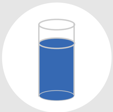
Maintain healthy drinking water supply