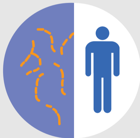
Minimize contact with dangerous bacteria and viruses